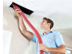
Hood & Duct Cleaning