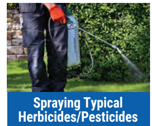
Spraying Typical Herbicides/Pesticides

Other Exposures: Cutting of Grass, Fences, Minor Patio Work, Planting of Seeds, Weed Whacking