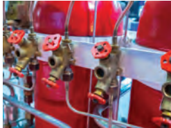
Foam & Chemical Systems