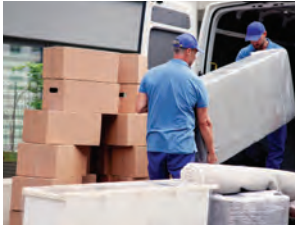
Household Goods Moving