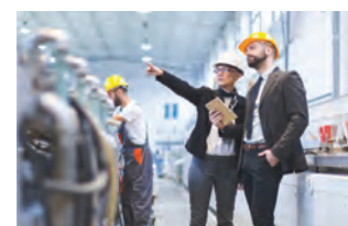
Engineering/ Architects Consulting