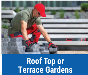
Roof Top or Terrace Gardens