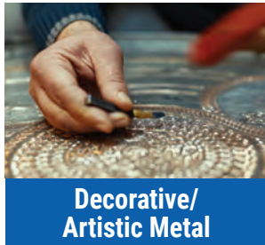
Decorative/ Artistic Metal