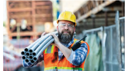
Work in NY state including the 5 Boroughs