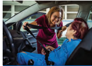
In Home Health Aids