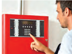
Fire Alarm Installation & Repair