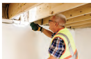
Visual Inspection Work