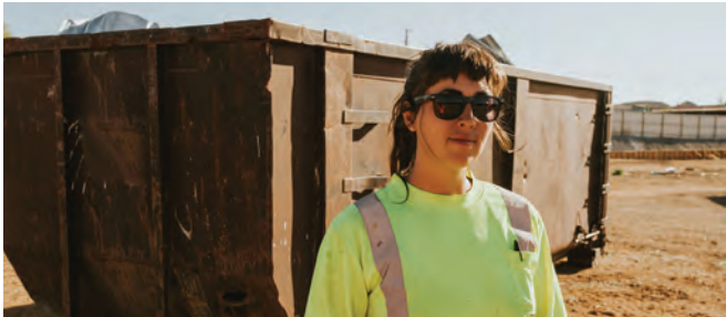
Roll Off Containers