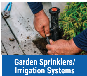
Garden Sprinklers/ Irrigation Systems