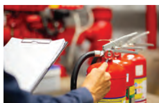
Fire Safety Consulting