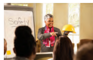
OSHA Training Courses