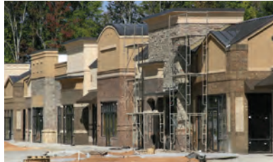
4 Stories max exterior height