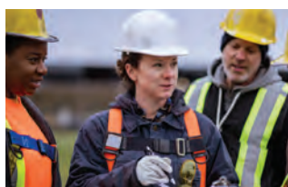
Site Safety Consulting