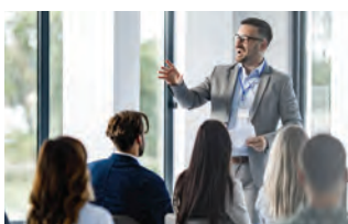
Training Sessions in Classroom & Office Settings