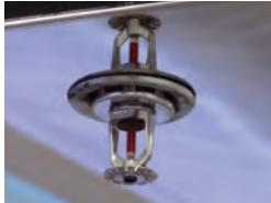
Wet/Dry Automatic Sprinklers