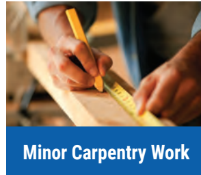
Minor Carpentry Work