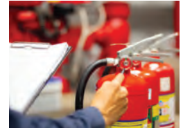
Servicing/Refilling Portable Extinguishers