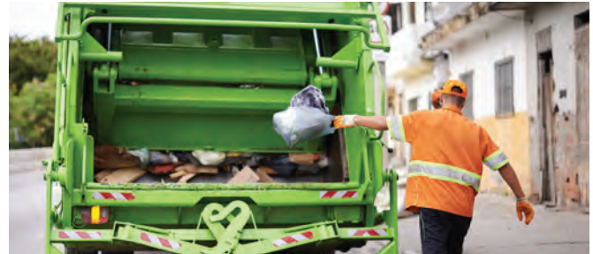
General Waste Hauling