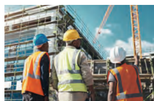
Construction Site Safety Consulting