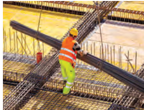
Rebar Mesh Fabrication and Installation